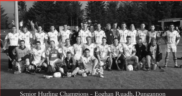
Senior Hurling Champions - Eoghan Ruadh, Dungannon