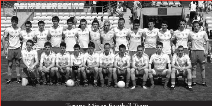
Tyrone Minor Football Team