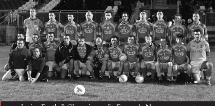
Junior Football Champions - St. Eugene's, Newtownstewart