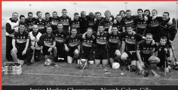
Junior Hurling Champions - Naomh Colum Cille