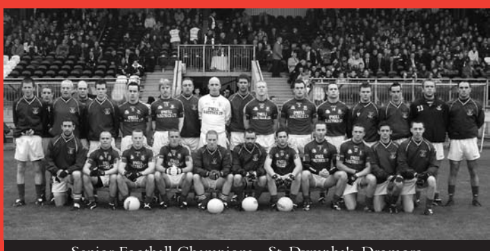
Senior Football Champions - St. Dympha's, Dromore