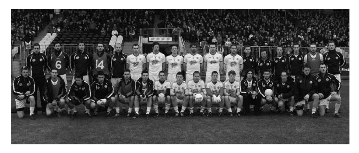
Tyrone Senior Football panel – NFL finalists 2013