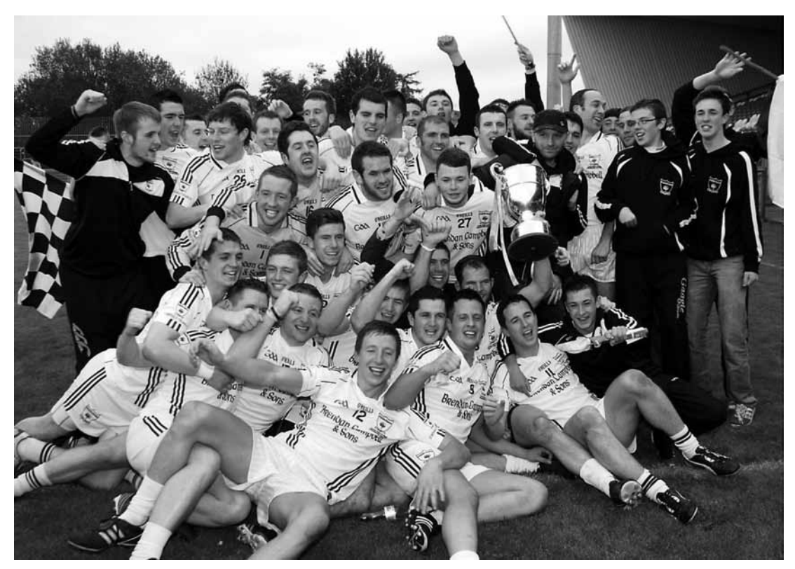
Senior football County Champions, Clonoe O'Rahilly's in Healy Park