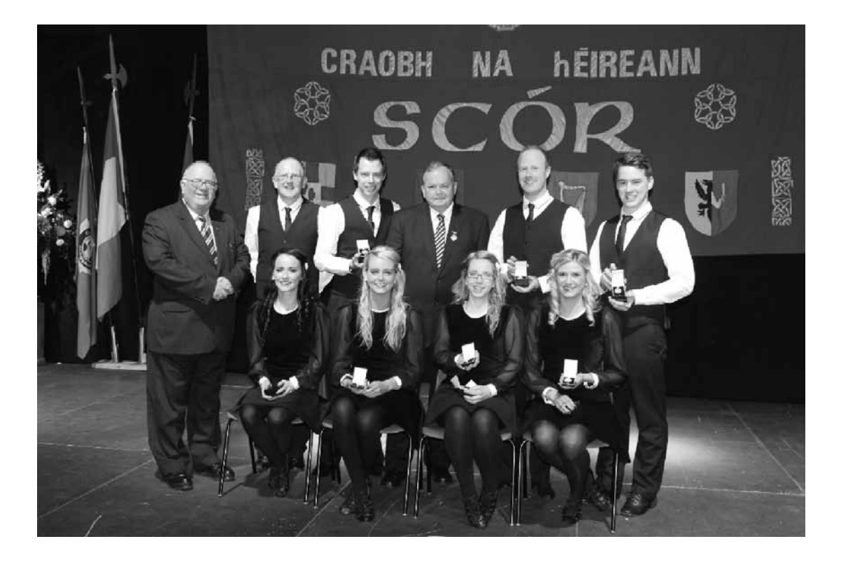
Cumann Naomh Eanna An Omaigh, All Ireland Rince Foirne Champions 2013.

Omagh St Enda's, in Ceilí Dance were to be Tyrone's only Ulster Champions on the night. The competition was stiff and all the others could only be described as 'whiskers' away from Ulster titles on the night. The All Ireland Final of Scór Sinsear was held in The Venue, Derry on Saturday 27th April. Omagh St Enda's were crowned All Ireland Rince Foirne champions. Any All Ireland victory is sweet but the fact that this team had been in the exact same position the previous year, and denied the ultimate prize, made it all the better.