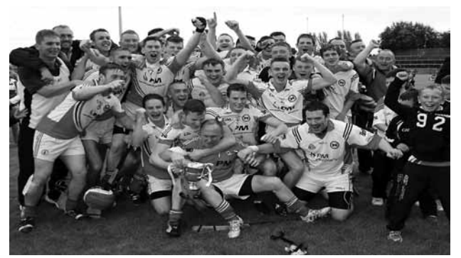
Senior Hurling County Champions, Dungannon Eoghan Ruadh