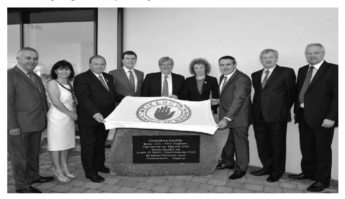
The Official Opening party at the Tyrone GAA Headquarters on 28th September 2013