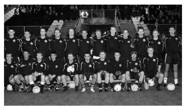
Intermediate Football County Champions, Eskra Emmett's