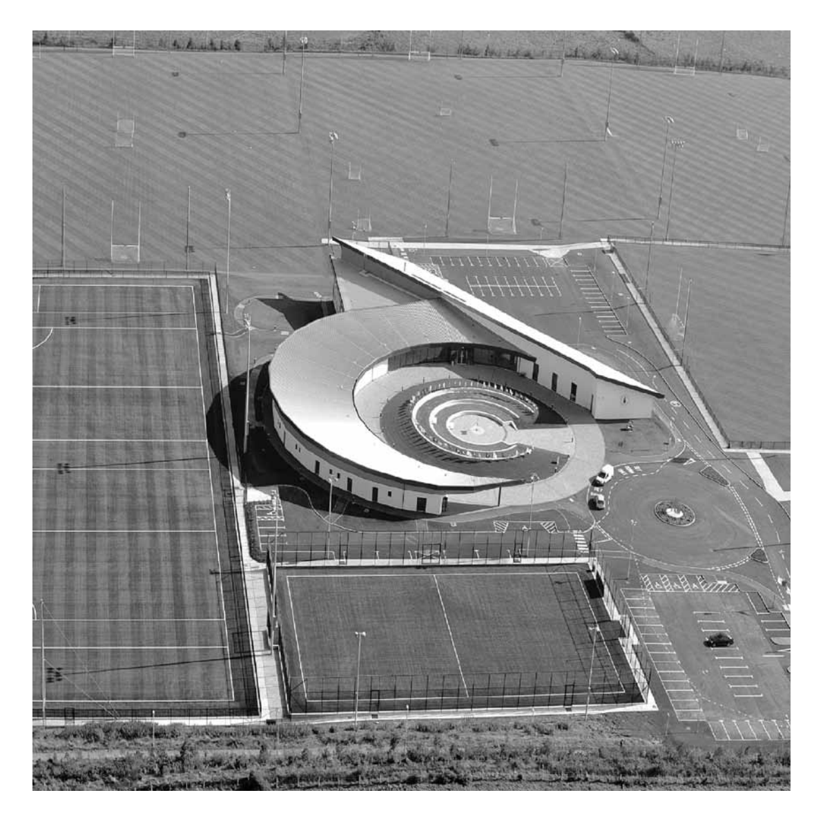
Tyrone GAA Headquarters – Aerial view on Opening Day

The whole management of the Centre and its operational funding will be a huge learning experience, in the initial years at least, and while it is anticipated that mistakes may occur from time to time, the Centre Management Committee will need to be highly proactive as well as being smartly responsive to the new situations that it will encounter. There should be no doubt that significant challenges will arise but we should be totally confident that Tyrone GAA will be able to meet them, as has been the case throughout its history.