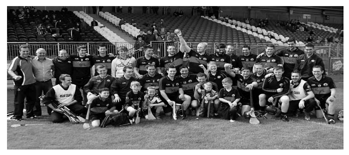
Intermediate hurling County Champions, Naomh Colum Cille in Healy Park