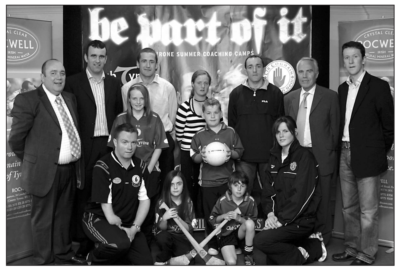
Launch of the Club Tyrone Summer Camps 2006

Tá súil againn go mbeibh Nollaig shona agaibh go léir agus AthBhliain shona freisin. Mar a dúirt an file cáiliúil 'ar aghaidh go deo a chairde leis an Cumann Lúthchleas Gael'.