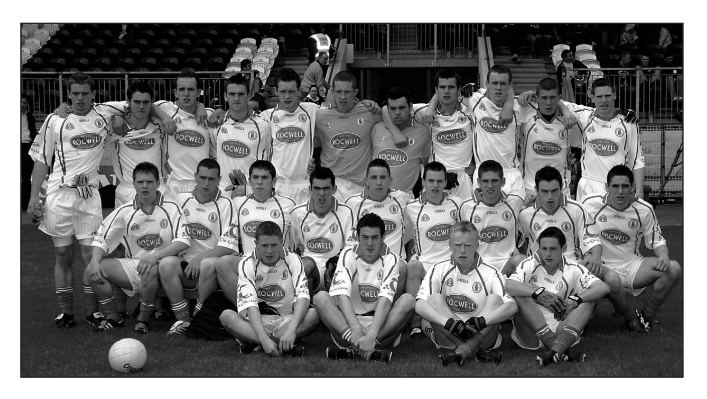
Tyrone Minor Football Team 2006

With the provincial championship concluded, all attention turned to the All-Ireland Qualifier series where first opponents were Louth. Here, Tír Eoghain had an outstanding first half, then allowed the opposition to take control and eventually had to fight back to draw the game. The sides remained level at the end of extra time and so the championship moved from Navan back to Healy Park. On their second chance, the home side emerged victorious by a margin of five points.