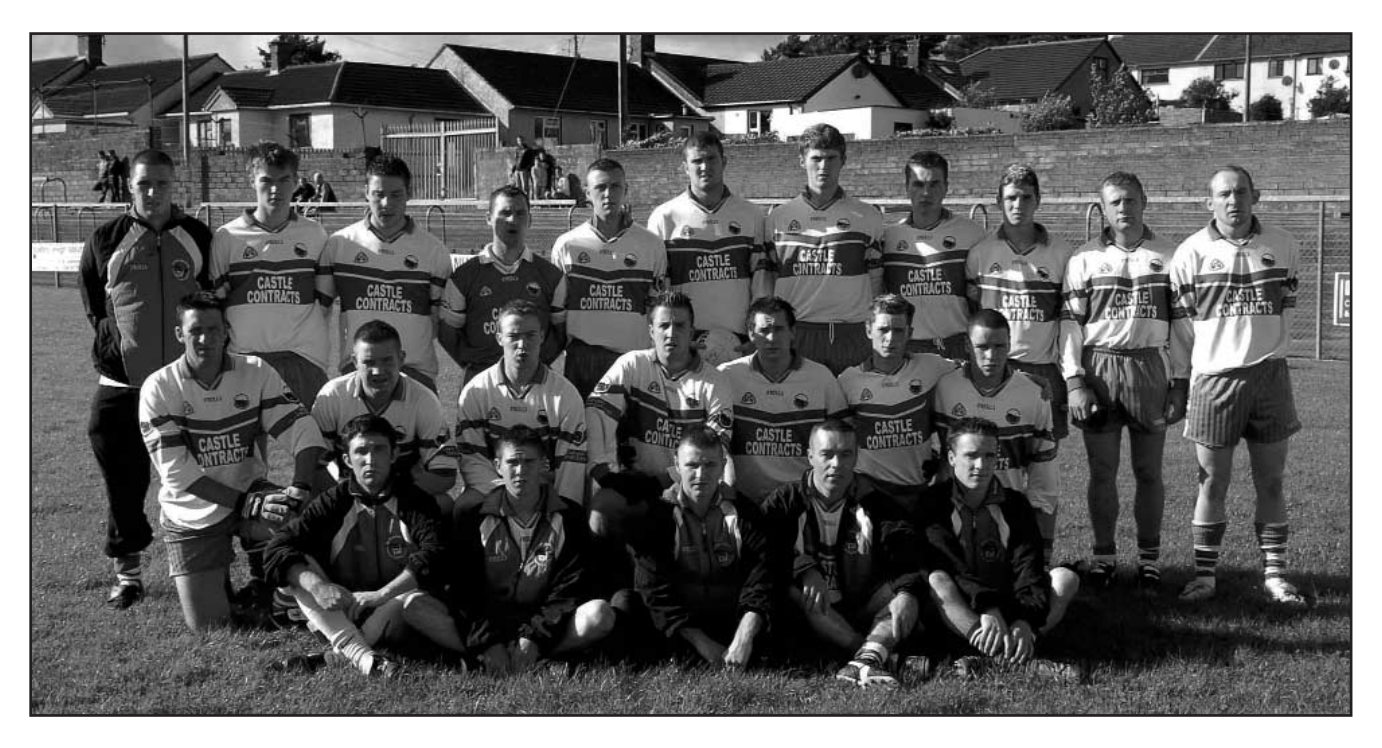
Junior Championship Winners, Greencastle

Development squads are also on the agenda for the forthcoming year, first of all identifying those suitable then following this up with the introduction of a squad with the relevant training and games that will benefit the county in the coming years.