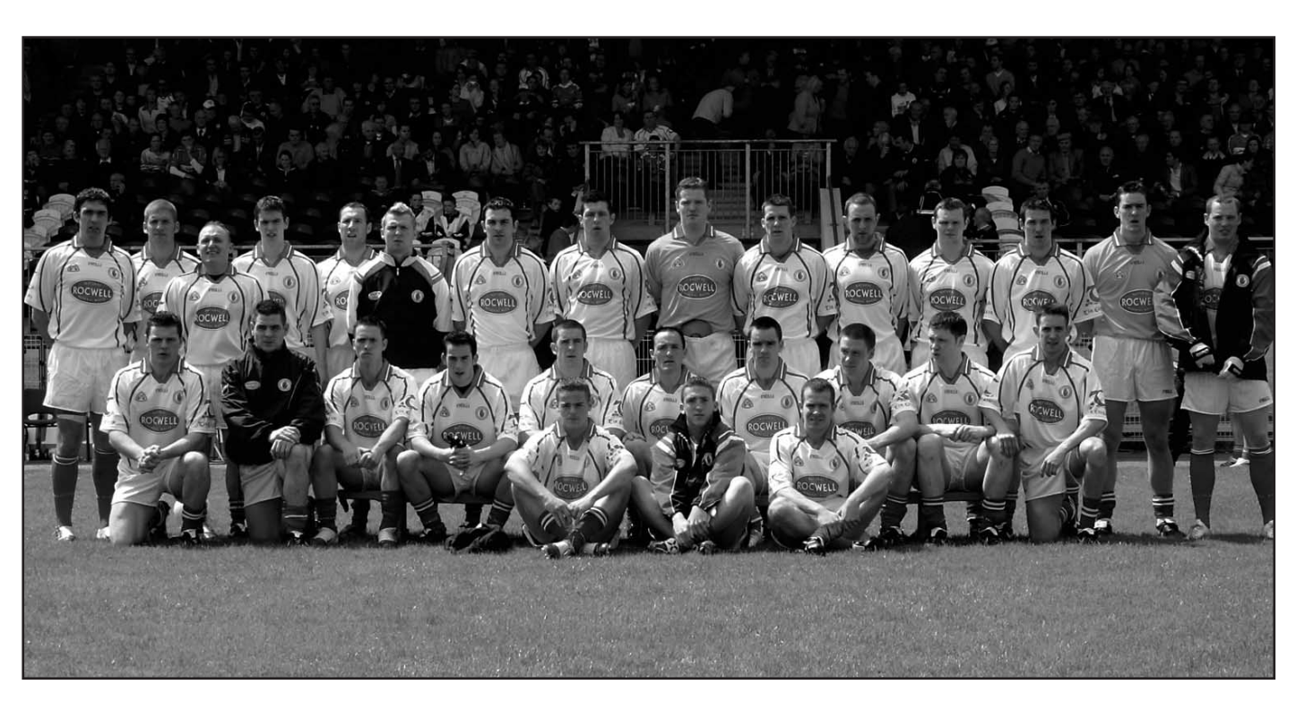
Tyrone Senior Team 2006