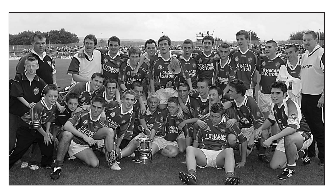
Minor Championship Winners, Coalisland

One of the major decisions of the year and indeed recent years has been the decision by clubs to revert to a 3 x 16 league system to be implemented in 2008 which I personally warmly welcome.