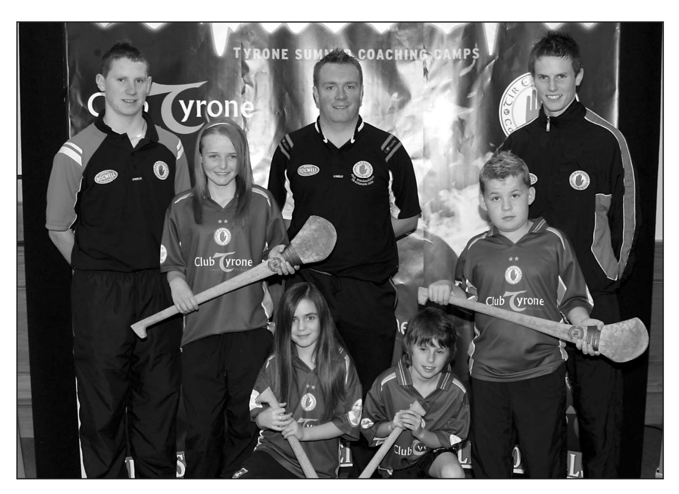
Pictured at the launch of the Tyrone Hurling Summer Camp Launch 2006

In the Ulster Club championships, the Tyrone representatives all made good progress in their opening fixtures, with Greencastle having a comfortable victory against Ardoyne (Antrim) before facing the challenge of Drumhowan. In their preliminary round, Stewartstown defeated St Brigid's (Antrim) following a replay, then eliminating Monaghan's champions Carrickmacross to earn a semifinal date against Armagh's Ballymacnab. At Omagh, Errigal Ciaran had a single-point victory against Enniskillen to reach the semifinal stage against Derry champions Ballinderry. At time of printing these competitions were ongoing.