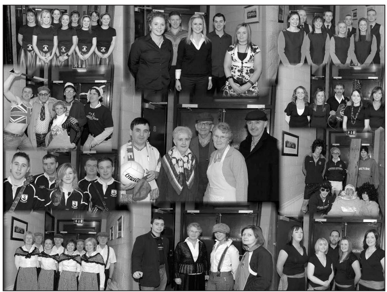
A selection of Clubs which took part in senior Scór in 2006

Bailéad Ghrúpa (Ballad Group):Omagh (Aghaloo).Nuachleas (Novelty Act):Aghyaran (Coalisland)Rince Seit (Set Dancing):Killyclogher (Omagh).Tráth na gCeist (Question time):Trillick (Killyman).