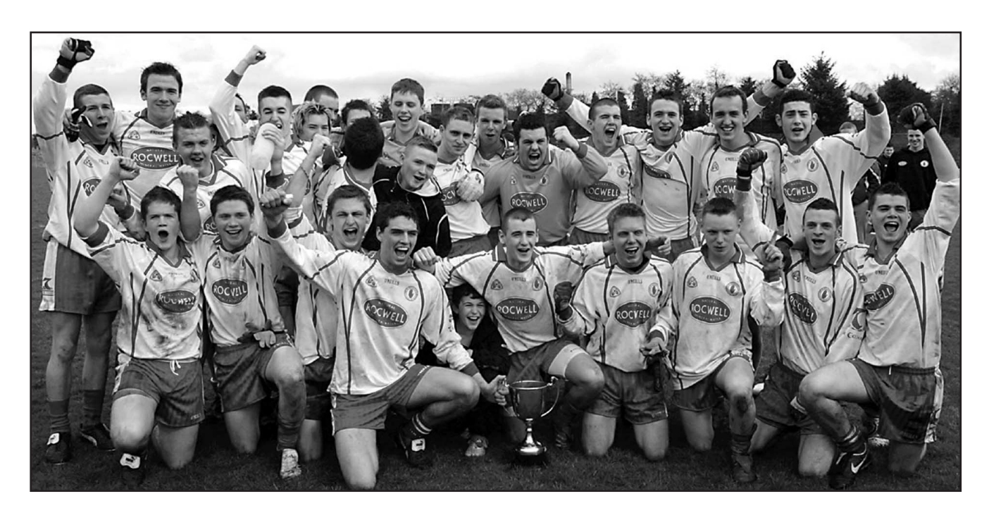
Ulster Vocational Schools Football Champions 2006

Another year of widespread activity and many significant successes that are considered further in the remainder of this report.