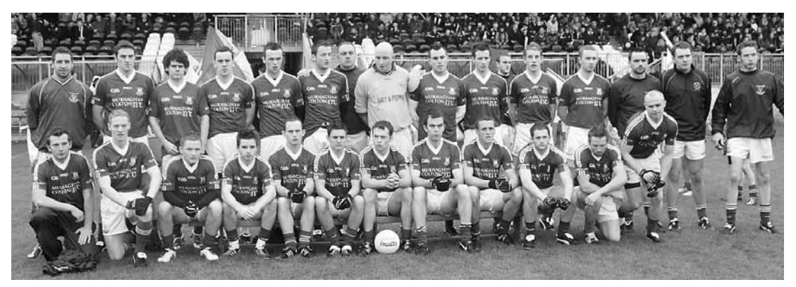
Dromore St Dympna's - Tyrone Senior Football Champions & Division 1 League Winner, 2011