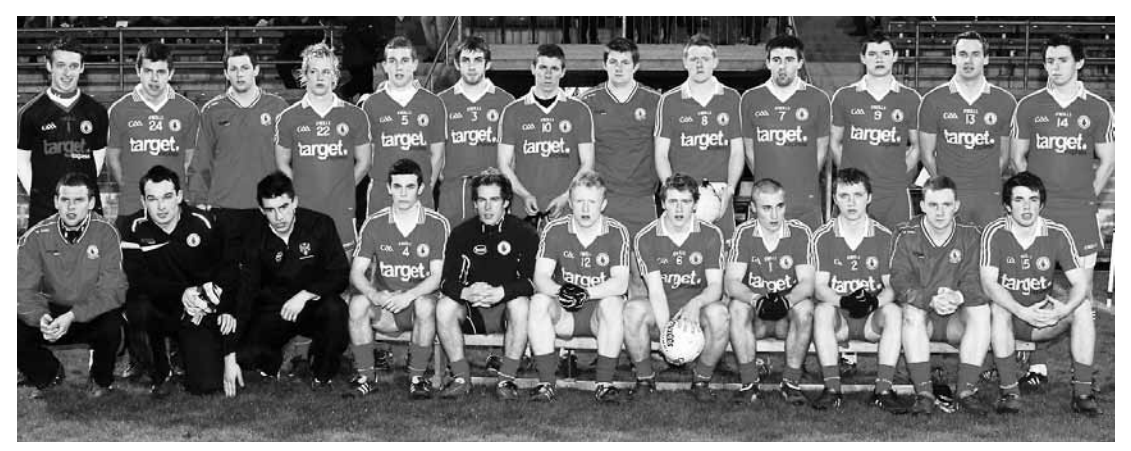
Tyrone Under-21 Football Team that reached the Ulster Championship Final in 2011.