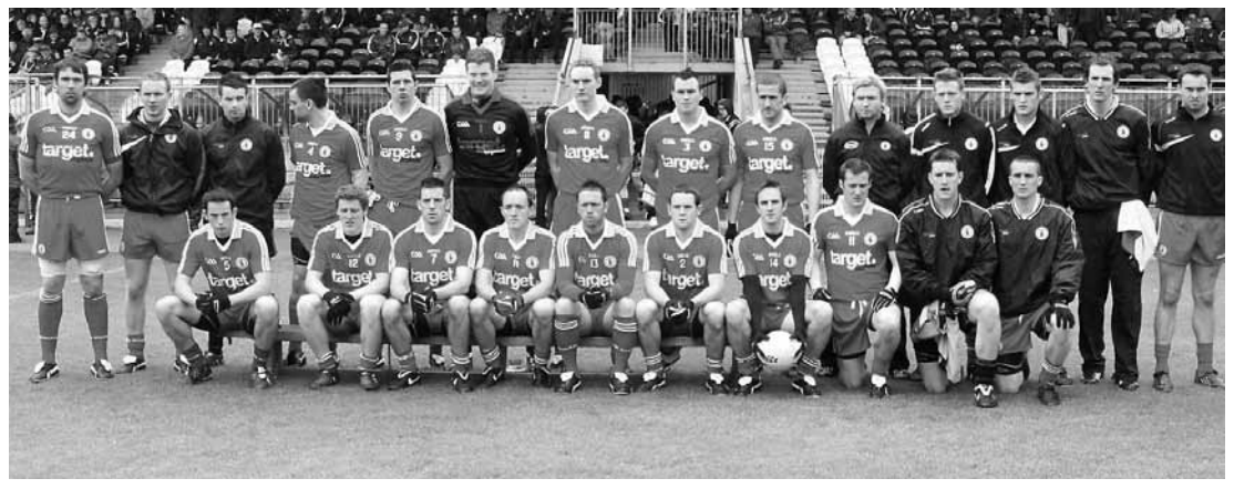
Tyrone Senior Football Team that reached the Ulster Championship Semi-Final in 2011.