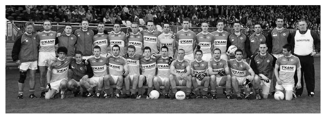
Kildress Wolfe Tones - Tyrone Intermediate Football Champions, 2011.