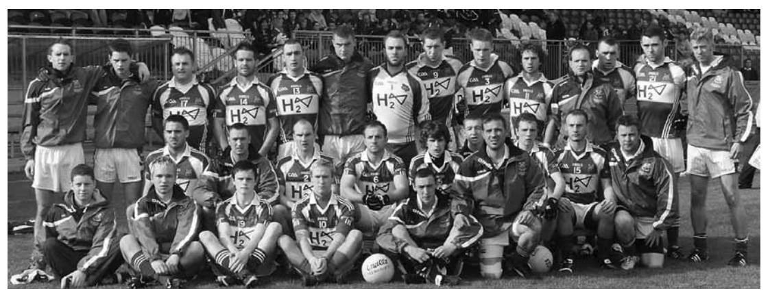
Derrytresk Fir an Chnoic - Tyrone Junior Football Champions, 2011.