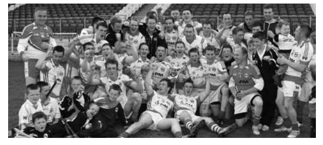
Senior Hurling Champions - Eoghan Ruadh, Dún Geanainn