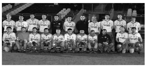
Tír Eoghain U21 Team 2012