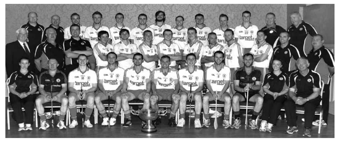
Lory Meagher Champions 2012