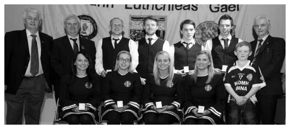
Omagh Ballad Group