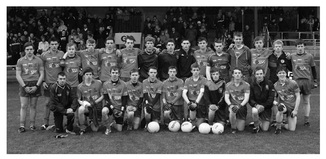
County Minor Champions - O'Donovan Rossa, Ardboe

County finals' day was one of double celebration for the Errigal Ciaran Club as its Juvenile team also won the Grade 1 championship in the curtain-raiser against a much-fancied Galbally side.