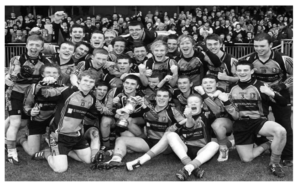
All-Ireland U18 Champions - Holy Trinity, Cookstown

At U14 level, Holy Trinity Cookstown were crowned Tyrone and Ulster champions with outstanding victories over Gaoith Dobhair, St Mark's Warrenpoint and Breifne College Cavan. In addition to winning the McDevitt Cup, Cookstown enjoyed further success at U18 level. In the Markey Cup quarterfinal they defeated Rosses Community School (Donegal) and then had a resounding semifinal victory over Ballybay Community School. In the Ulster final they faced near neighbours, St Ciaran's College Ballygawley that had defeated St Columba's Glenties and Virginia College. In the final, played in Healy Park, Holy Trinity emerged victorious on a scoreline of 0–14 to 0–06.