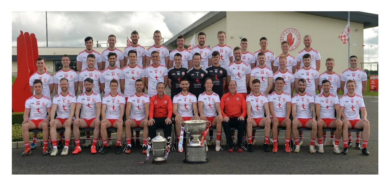
Tyrone Senior Football Panel (2021)

It was fitting that at the year's end as many as fifteen of these men deservedly received nominations for All-Star awards; two were nominated for 'Player of the Year' and one was included in the nominations for 'Young Player of the Year'. Congratulations to all.