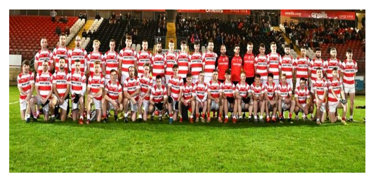
Intermediate Football Champions 2021 – St Malachy's Moortown

When it is recognised that, in total, fifty adult championship games were successfully completed in a period of just fifty-three days we can begin to realise the massive amount of work undertaken by a comparatively small number of people, as above, all of whom were doing so in a voluntary capacity. We cannot pay a high enough tribute to them.