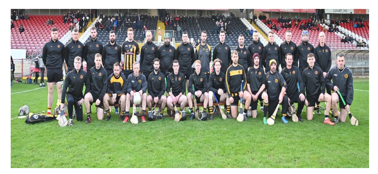
Senior Hurling Champions 2021 – Éire Óg Carrickmore