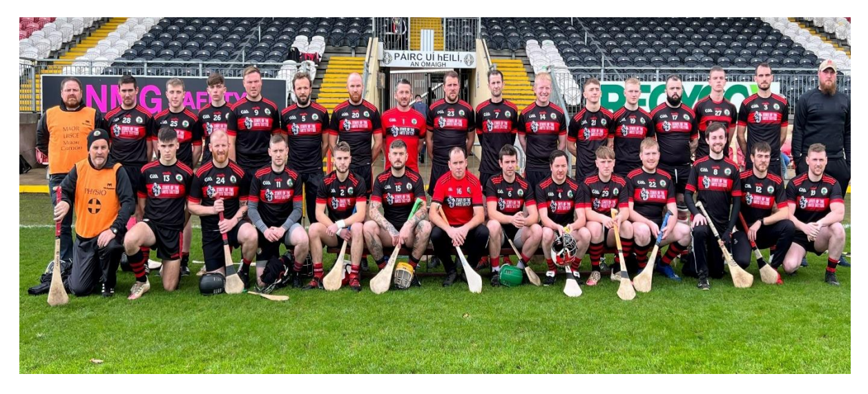
Junior Hurling Champions (2021) – Naomh Colum Cille